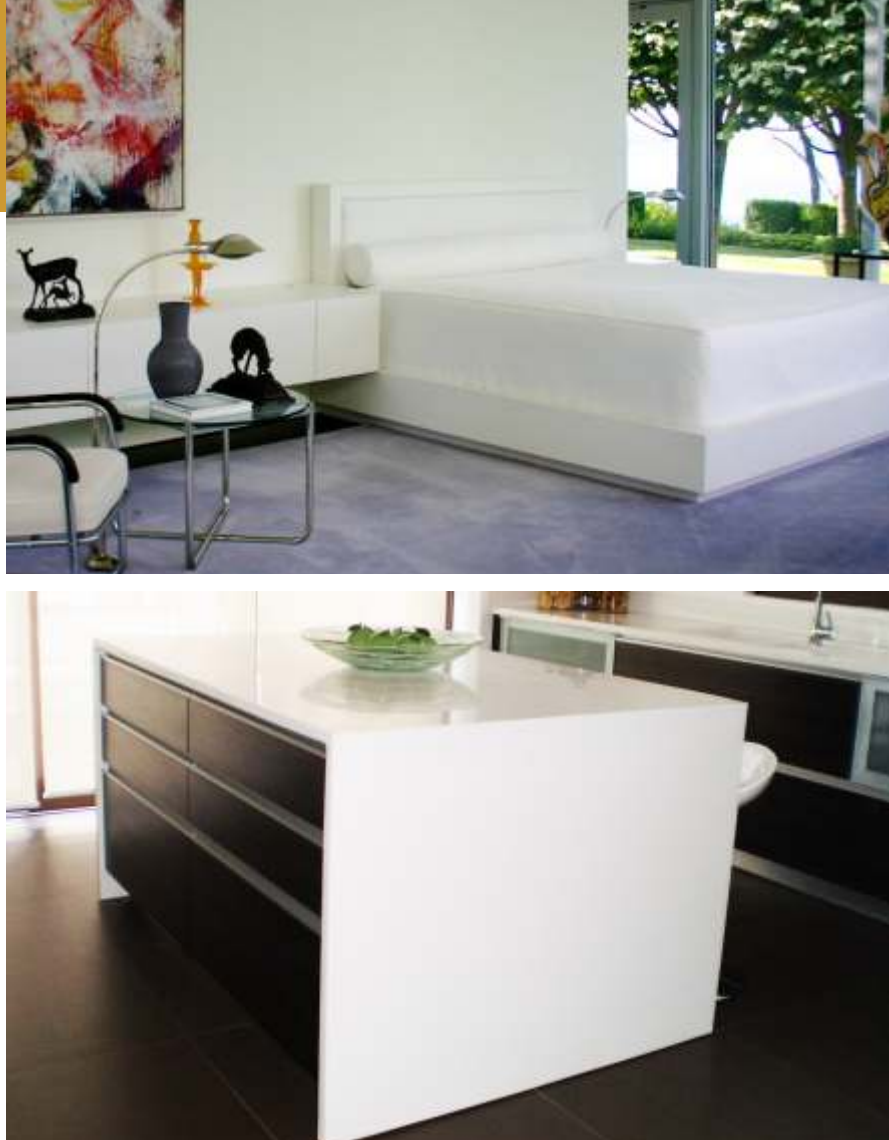
Table Top • Wall Cladding • Wardrobe Shutter • BedCladding • Pillar Cladding • False ceiling • Murals• Furniture Cladding • Wall Paneling with CNC cut

Get ready to explore endless design possibilities to adorn your dream home. Let your imagination come to full fore and be sure to transform it in to a beautiful reality. Blending aesthetic appeal with unmatched strength, it's an eternal bond of elegance and performance.